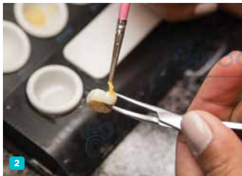
Fig 2. Staining full-contour zirconia crowns. Fig 3. A completed anterior restoration.