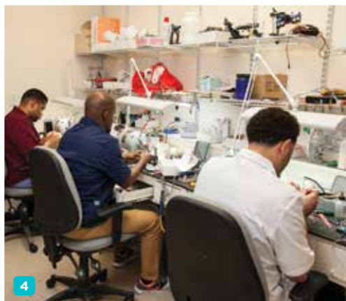
Fig 4. Removable technicians setting denture teeth.